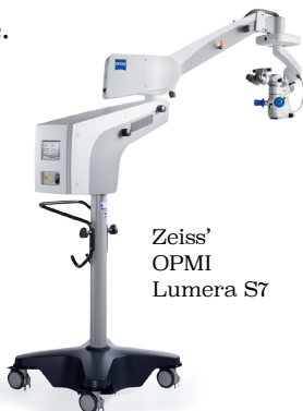
Zeiss' OPMI Lumera S7

Surgical Direct is able to provide great assistance with your surgery center's inventory management needs. Not having the headache of keeping up on inventory, you and your staff can focus more on patient care. This helps ensure that your procedures are not only efficient, but profitable!