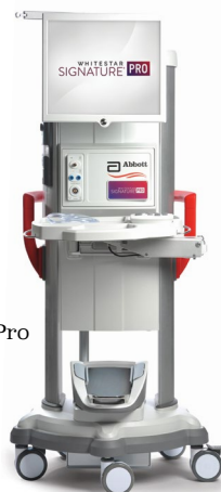
Abbott's Whitestar Signature Pro