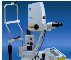
The Latest Mobile Cataract Equipment