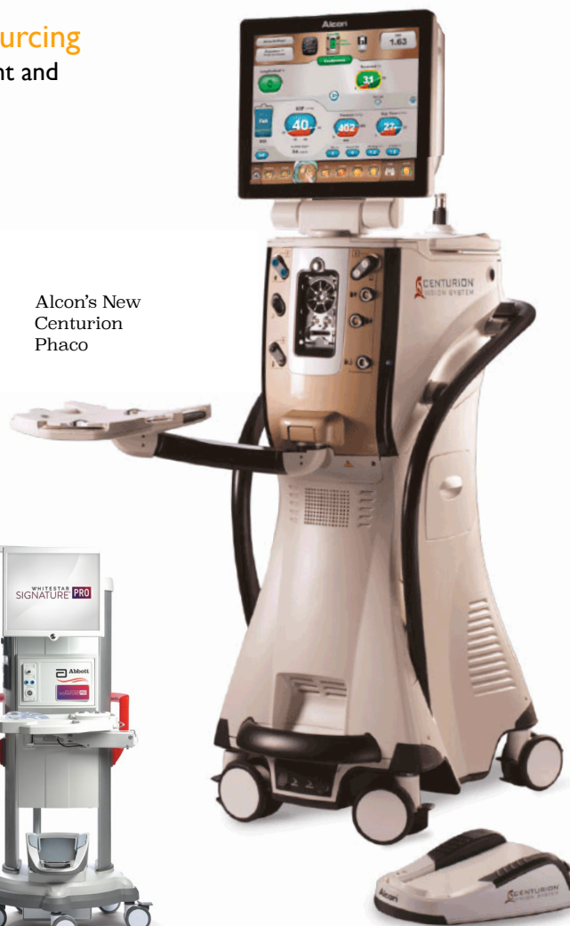
Alcon's New Centurion Phaco

Call (800) 346-0544 for a FREE DEMO DAY!