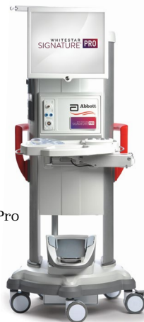
Abbott's Whitestar Signature Pro