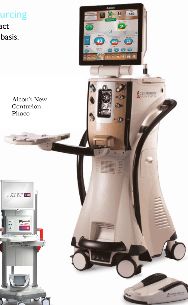
Alcon's New Centurion Phaco

Call (800) 346-0544 for a FREE DEMO DAY!