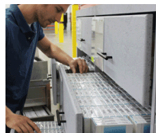
Tremendous Scope of Trusted Name Brand Products