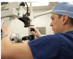
A Reliable Continuity of Trained Ophthalmic Technicians

Our professional technicians are phaco certified and receive training in OSHA, HIPAA, blood-borne pathogens, aseptic technique, fire safety and operating room protocol, and have received extensive training from the leading cataract equipment manufacturers such as Alcon, AMO, B+L, and Zeiss. All of our technicians carry all necessary business insurance and are vendor certified at each facility.