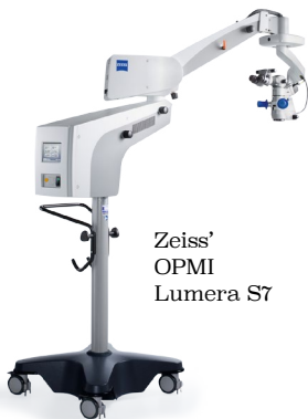
Zeiss' OPMI Lumera S7

Surgical Direct provides a large inventory of the latest phacos, surgical microscopes, lens implants, YAG and SLT lasers. This latest equipment, together with our trained technicians managing your work flow, allows you to move from case to case with confidence and efficiency.