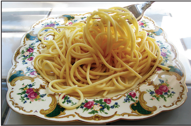
Figure 11-2A. Long-chained molecules of cohesive OVDs behave like spaghetti during conditions of high shear. They tend to entangle and leave the eye as a bolus. This makes cohesive materials much easier to remove at the conclusion of a procedure.