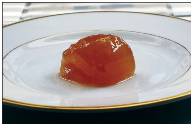
Figure 11-1A. Cohesive OVDs behave like jelly or jam under conditions of zero shear (when there is no fluid movement in the eye). The long-chained molecules of cohesive OVDs tend to intertwine and “lock in position.” This creates a scaffolding effect intraocularly that helps these OVDs to maintain space very effectively.