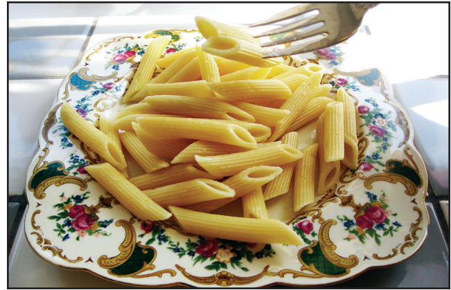
Figure 11-2B. Short-chained molecules of dispersive OVDs under conditions of high shear behave like penne. The molecules do not tend to interlink and stay in the anterior chamber much more effectively than do cohesive OVDs. For this reason, dispersive OVDs of sodium hyaluronate provide superior endothelial protection in conditions of high shear, especially during phacoemulsification.